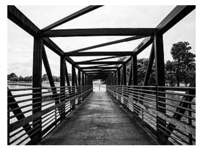
When the Bayou Greenways project is complete, it will bring an estimated 1.5 million Houstonians within 1.5 miles of green space.