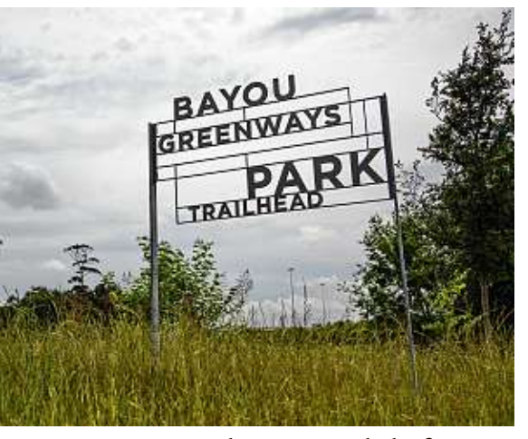
Bayou Greenways Park serves as a hub of sorts for Bayou Greenways 2020, a 172-mile project.

A paper boat bobs eerily along White Oak Bayou while joggers, cyclists and walkers move with more determined purpose along a path at the top of its banks. The scene is quintessentially Houston: flowing green landscape punctuated by the yellow of black-eyed Susans and the white of other wildflowers and plenty of concrete. Barn swallows swoop past within sight of a freeway where cars move less freely. The chirp of birds is audible, though they compete with the unavoidable