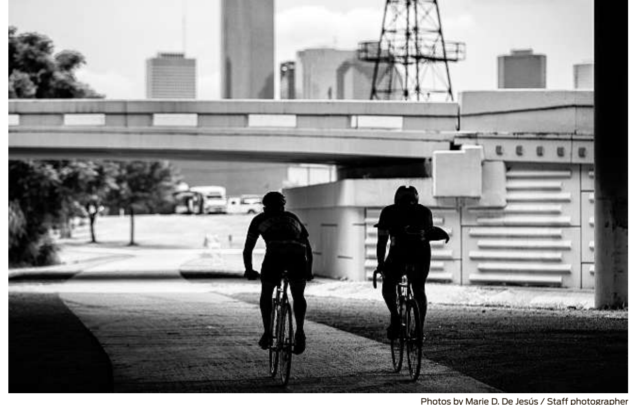
Cyclists ride on the White Oak Bayou Greenway Trail. The trails are meant to be accessible to all Houstonians.

'We always heard, 'Nobody uses parks in the winter, so why are you building this? "White said. "But people do want to be outside. And in particular, they want to be near water. It's one of those strong attractions for human beings on a molecular level. I'd hear about people in Chicago who would cut through fences and make their own trail to be near the water. I think there's a similar thing with the bayous. They're a lifeblood of this city, and people want access to them. But creation of these spaces is a labored process. White likens it to assembling a jigsaw puzzle. Future plans will seek to provide more northsouth connections between these paths. But the goal of Bayou Greenways 2020 was to find ways to cinch together these east-west paths.