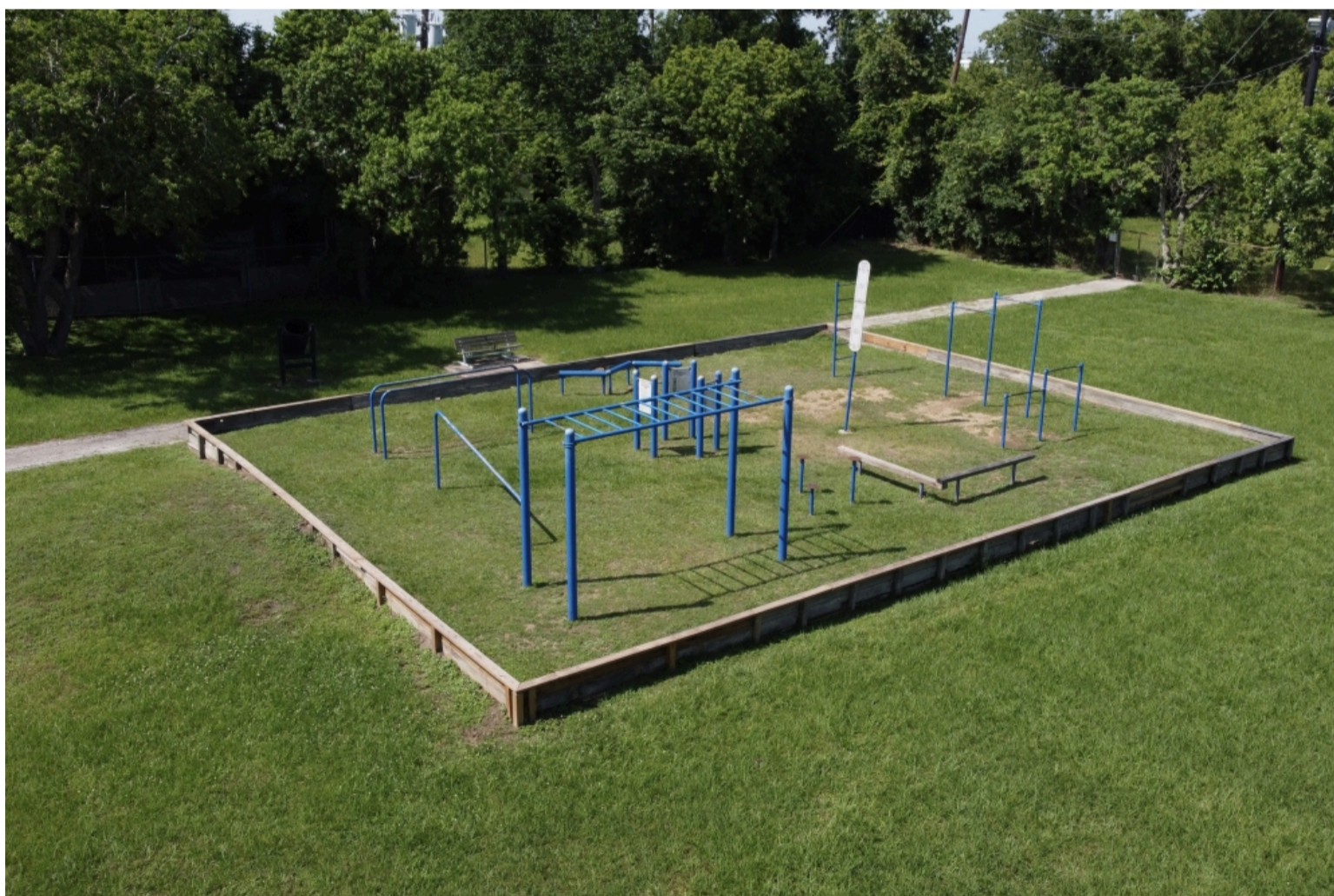
Andover Park is one of 25 parks chosen to receive upgrades.

A public-private partnership called Let's Play Houston will distribute $60 million worth of park upgrades across all 11 Houston City Council districts. Two to three parks per district were selected for improvements through the citywide program.