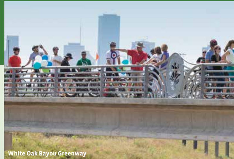
White Oak Bayou Greenway