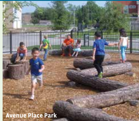
Avenue Place Park