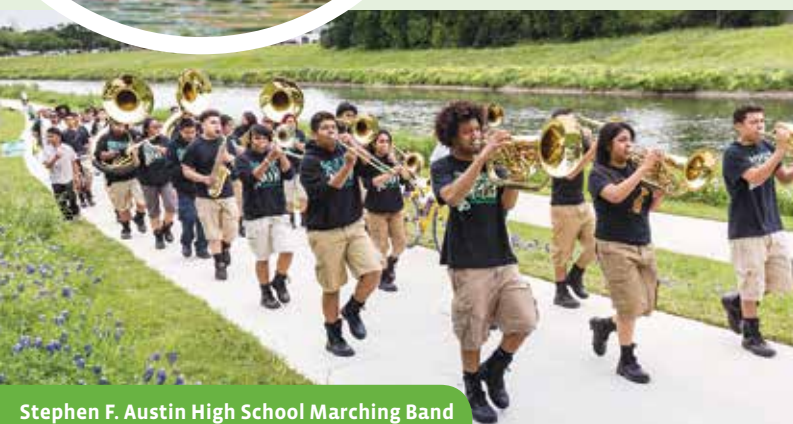
Stephen F. Austin High School Marching Band