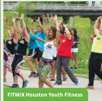
FiTmIX Houston Youth Fitness