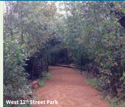
West 11th Street Park