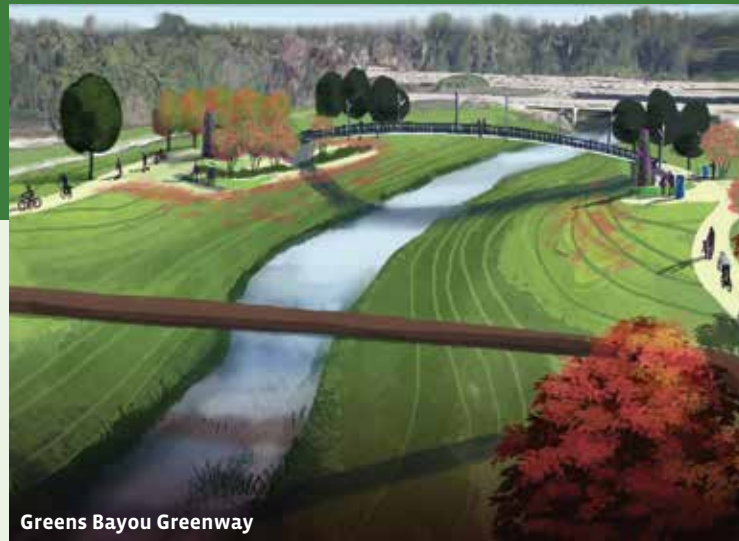
Greens Bayou Greenway