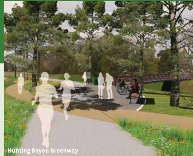
Hunting Bayou Greenway