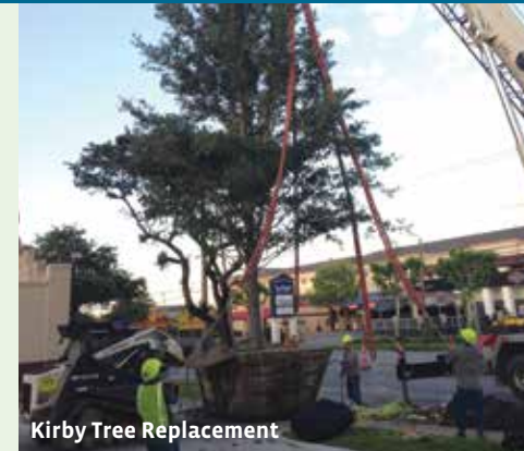
Kirby Tree Replacement