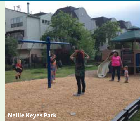
Nellie Keyes Park