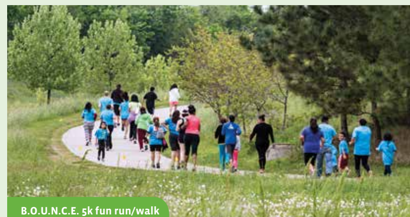
B.O.U.N.C.E. 5k fun run/walk