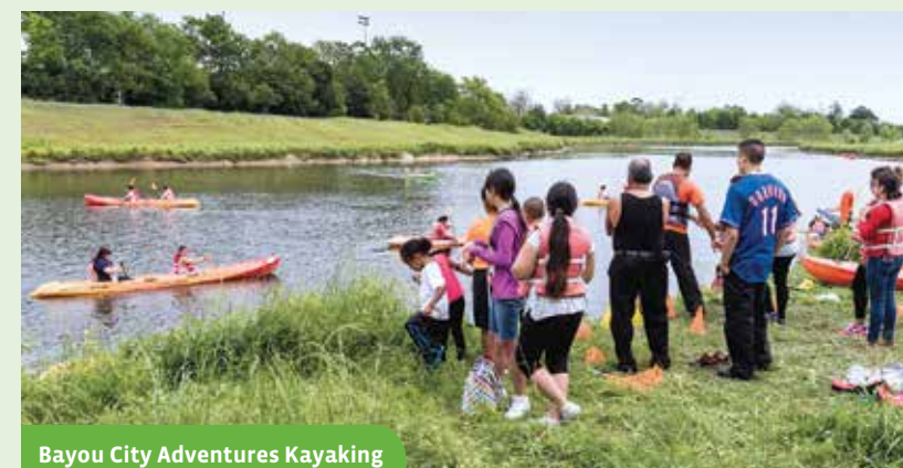
Bayou City Adventures Kayaking