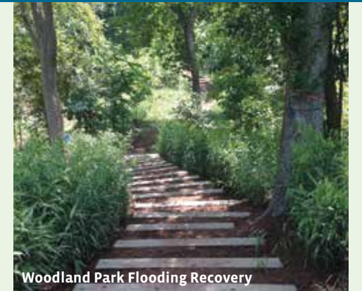
Woodland Park Flooding Recovery