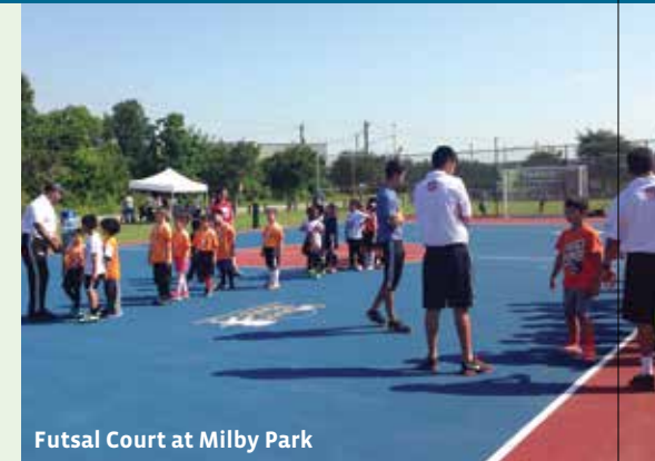
Futsal Court at Milby Park