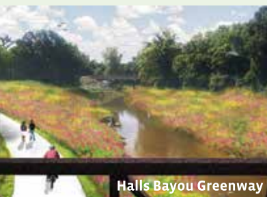
Halls Bayou Greenway